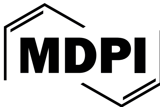
Figure 1. This is a figure. Schemes follow the same formatting.

All figures and tables should be cited in the main text as Figure 1, Table 1, etc.